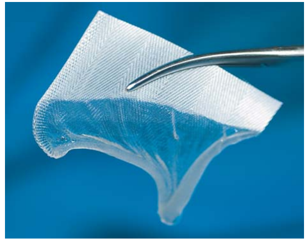
Forms a transparent gel quickly upon contact with blood